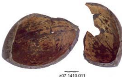
Figure 1. Parts of the broken flask with yellowish sediment.

Within the "Troia Project" (head: Prof. Dr. M. Korfmann 2 ) carried out by the University of Tübingen pieces of pottery were excavated in 1997 3 within the ruins of a Late Bronze Age house (late Troia VI) destroyed by fire. The potsherds (Figure 1) were parts of a broken "pilgrims' flask", i.e. a flask of oval shape with a handle and narrow mouth (Figure 2: height: ca. 27,5 cm, width: ca. 18 cm, mouth inside: ca. 3,4 cm), obviously destined to contain a liquid.