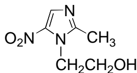
Figure 1. Metronidazole [1-(2-hydroxyethyl)-2-methyl-5-nitroimidazole].

screening of plants extracts from traditional preparations used in popular medicine. Numerous plants are used in the indigenous system of medicine of many countries for the treatment of dysentery. 5-11 They require more thorough investigation in order to validate their activity and that may uncover new leads for amoebicidal drugs.